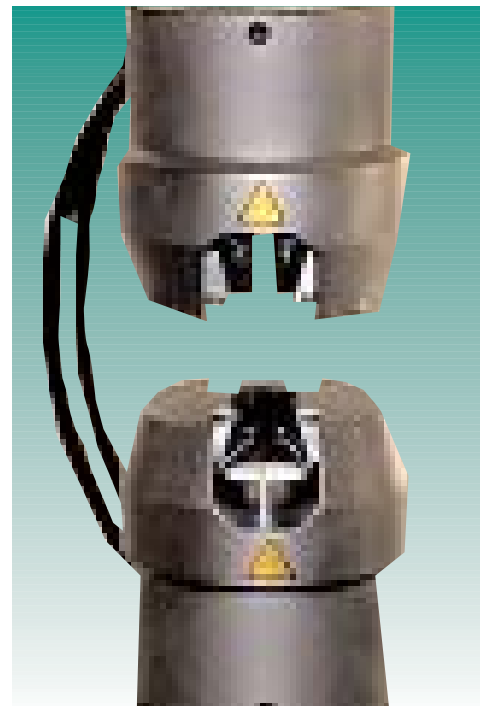
▲ Axial/ torsional hydraulic grips