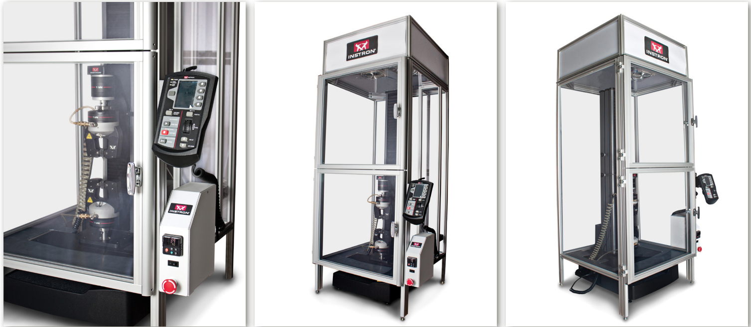
Dual doors allow for flexible access and reduced heat loss

BioBox is not compatible with the following fixtures: AVE/SVE, 90° and Variable Angle Peel Fixtures, COF Fixture, Extra Long XL Extensometer